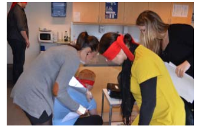
As usual the blind folded participants had lots of fun used the newly acquired language

In Denmark we celebrated the last official pools-m project day with a course for primary school teachers who experienced the strength of the PhyEmoC method and had a taster of CALL