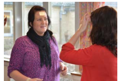
In order to demonstrate the strength of the PhyEmoC method the participants learned the names of body parts in French followed by commands and prepositions so they could navigate blind folded between bottles without bumping into these

The pools projects have been funded with support from the European Commission. This publication reflects the views only of the author, and the Commission cannot be held responsible for any use which may be made of the information contained therein.