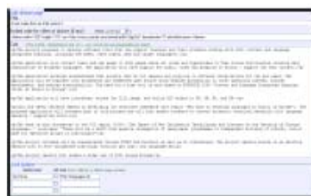
Editing a page in Clilstore

When the page has been created you go back to the menu and select the pencil icon to edit the page (this is a very early prototype) you can now select how the text will behave, e.g. scrolling below the video, and you can enter a link to exercises, at the moment you need to insert the full url complete with http://