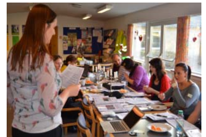
The participants came from the Danish "Folkeskole" called Kroggaardsskolen in Odense