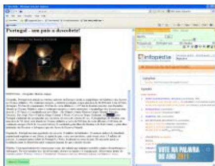
A webpage created in Clilstore

You can get a taster of what will be the project results from http://multidict.net/clilstore where you can test ready to use language learning pages with all words linked to online dictionaries. And from where you can create your own teaching materials immediately online and for free. The system is of course still very simple, but it works.