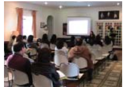
Course participants at the Portuguese as a foreign language course in Evora

A fter we finished the pools-2 project period we have been contacted by the Executive Training Institute (ETI) Malta who plan to align their TEL course to the POOLS-2 and POOLS-M courses. ETI would like to promote and contribute to the dissemination task of the programmes developed by POOLS and act as a training provider and facilitator offering in-service training which refers to the POOLS Project/Product addressing all teachers in the EU as well as those states participating in the EU LLP.