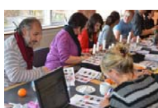
Pools members in action across Europe