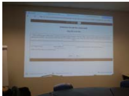
From one of the courses on Computer Assisted Language Learning supported with Hot Potatoes

Apart from this process, we have had contacts with some of the course participants as far as the follow-up activities of POOLS-M which include the exploitation of the methods studied in respect of POOLS-M piloting courses are concerned. We have been able to obtain some audio-visual stuff from the course participants which displays the work their students have done using the methods studied in respect of POOLS-M piloting courses which were organised in Marmara Schools.