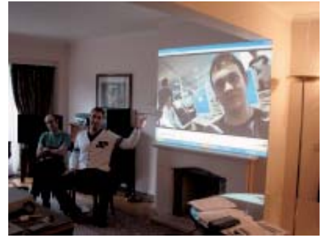
Dutch student feedback through a Youtube.com video