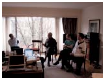
Activities during the POOLS-T workshop in Brussels