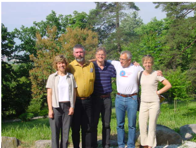
"eTandem partners from Spain, Holland and Denmark: lots of learning tips from your eTandem partners"

Of course, you cannot simply copy everything your partner does: he or she may have a very personal style or regional dialect, may make an occasional mistake here or there, etc. However, it won't take long to get used to these things.