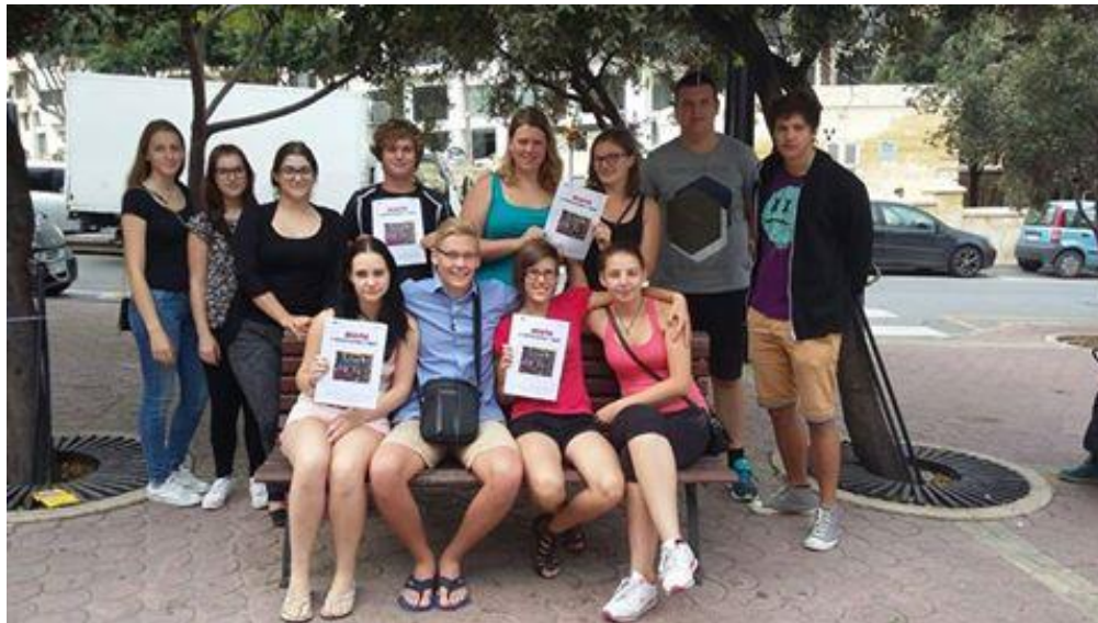
Students from 6 Slovenian schools in gastronomy and tourism using the International Work Placement Guide in internship in Malta - October 2015

The Slovenian and Maltese partners SGGT - ETI pursued their excellent collaboration by sustaining actively the METHODS results with Erasmus+ teacher mobilities and internships of students beyond funded lifetime: