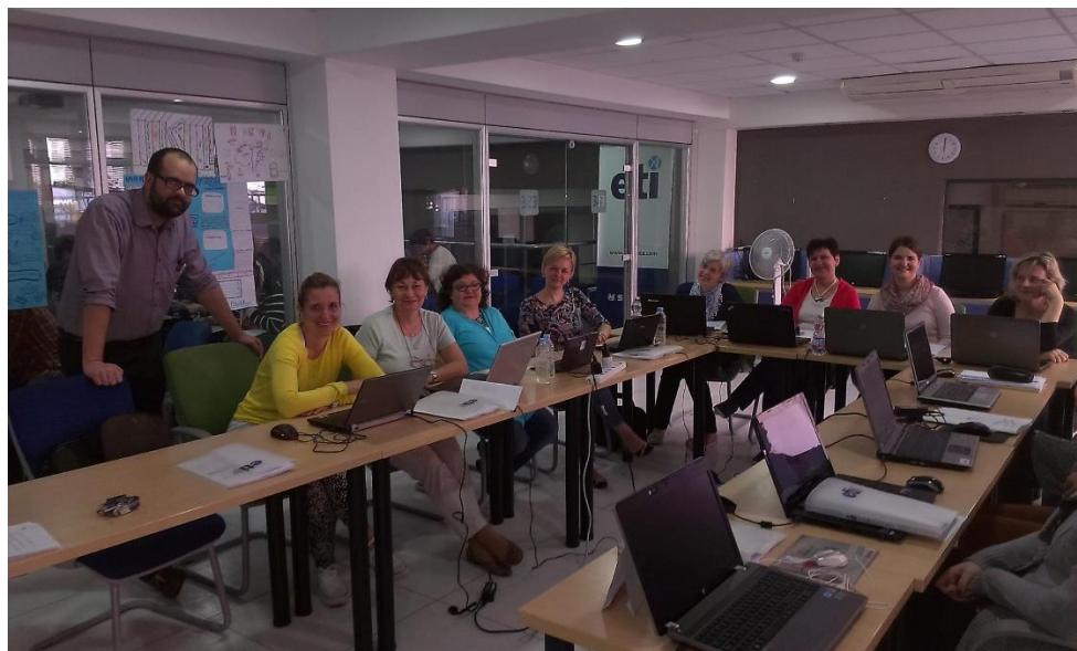
METHODS and CLIL hand in hand : 12 teachers from 6 Slovenian gastronomy and tourism schools are attending a course "Using CALL at ETI Malta, within Erasmus+ staff mobility project.