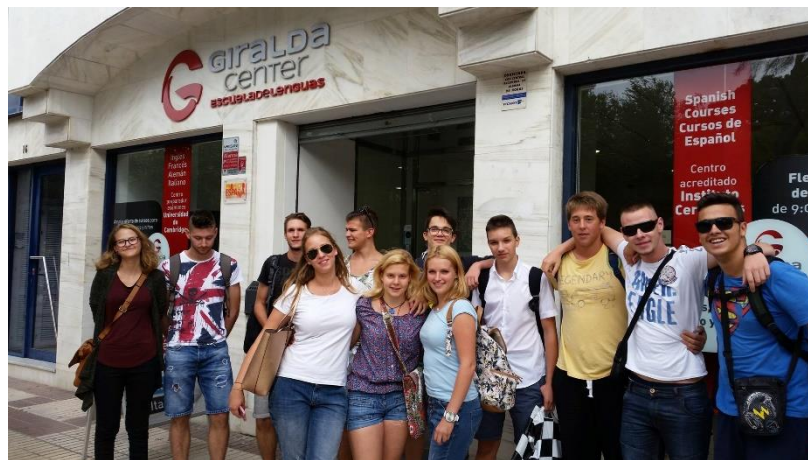
Slovenian students in catering and tourism from SGGT Cejle using METHODS International Mobility Guide in their exchange mobility in Sevilla Spain ( 2015)

The project analyzed and updated the “Work Placement Preparation Guide” transferred from BP-BLTM and Pools-M previous projects for Erasmus+ mobility of students preparing for work placement in other countries. As we presented in detail in the Interim external evaluation report, the new ‘International Work Placement Preparation Guide’ helps not only the students but offers a valuable collection of information and good practice to the sending and receiving institutions to help VET institutions and young people to prepare and succeed in their international work placement experience.