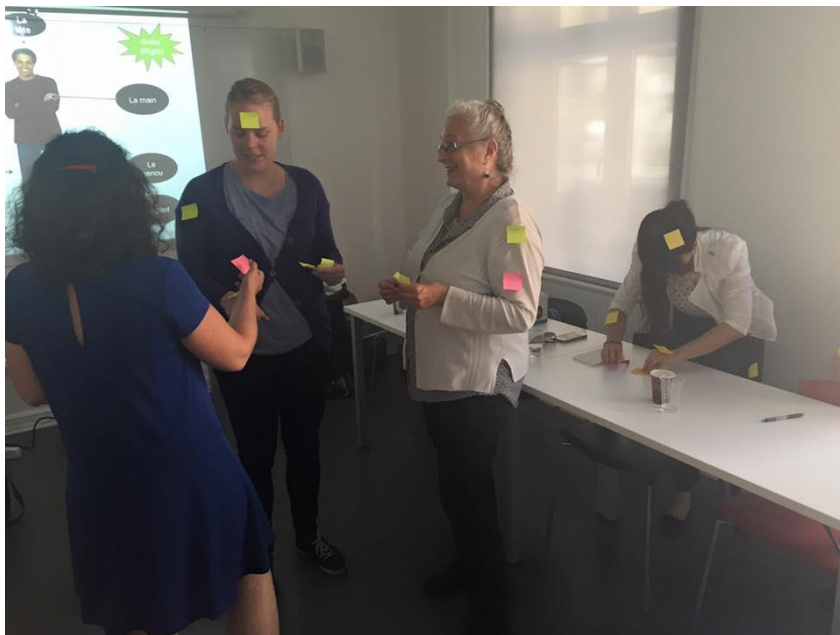
Teachers attending METHODS workshop in Sweden , June 2015