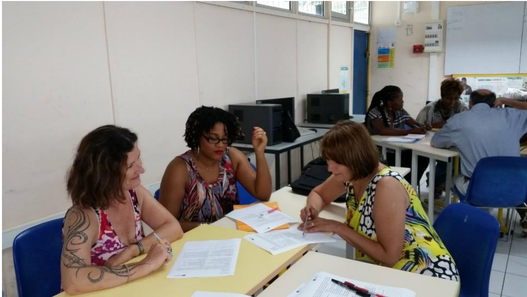
Teachers attending METHODS workshop in Guadeloupe, June 2015

The Danish partner that transferred the outcomes has also undertaken further exploitation initiatives of METHODS to Sweden VET College.