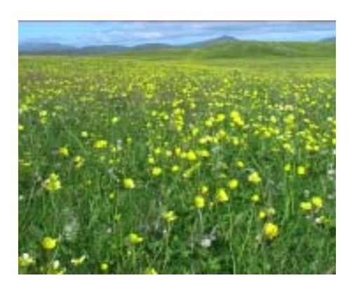
Wildflowers on the Hebridean machair: a unique environment

Sabhal Mòr Ostaig, the Scottish partner, is planning to build on its video and training work completed for POOLS by launching a larger "Guthan nan Eilean: Island Voices" project. This project will aim to significantly increase the size of the bilingual resource bank with a Scottish and Highland cultural and vocational relevance, for the benefit of learners of both Gaelic and English. Training, based on the frameworks established in the POOLS project, will also be offered, and learners as well as teachers encouraged to develop new media and computing skills.