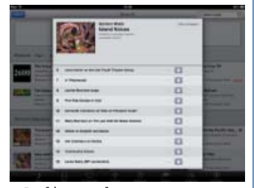
Audio podcasts on Island Voice

padio audio clips can be used very flexibly. As we know already, you can embed them in a Clilstore unit. Or you can post the links in your Facebook or Twitter accounts. You can also make podcasts of them, and even place them in iTunes!