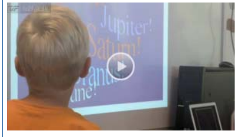
Pupils from Kroggaardskolen in Odense learning the Clil4U way

atch a Danish class from a primary school in Odense, Denmark working with a scenario prepared by a Spanish Clil4U partner: <a href="http://www.tv2fyn.dk/article/468179:Natur-og-Teknik-paa-engelsk">http://www.tv2fyn.dk/article/468179:Natur-og-Teknik-paa-engelsk</a>