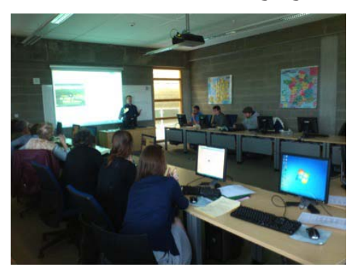
Waterford workshop on TOOLS

he Ulster Tools team has been Gaelic, attention was also paid to busy in recent months distanting Clilstore and its relation to the Welsh language.