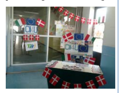
A Danish day in Bussero celebrating Clil4U

We organized a stand dedicated to CLIL4U project and the partnership between Denmark and Italy, with the exhibition of the products and the materials sent by the Danish school, which gained curiosity and interest by the visitors. Some pupils of the fifth year, have realized a television news in which the CLIL4U Project was illustrated. A Danish family who lives in the village helped the teachers in performing the Danish songs.