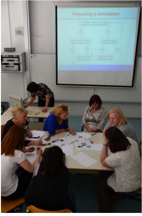
The Slovenian team working with the "Simulation" method

successfully disseminated and promoted on the school webpage and at different events like: national conference »Languages in education«, presentation of the Leonardo da Vinci mobility project on the national level, international meetings with partners from other projects, visits of partners from Germany and Hungary etc. The National Education Institute of Republic of Slovenia was contacted for support in further piloting activities which are starting in autumn 2014. Recently, our team has also started translating the adapted manuals - it's going to be a long, hot and working summer.