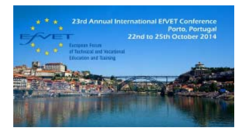
Meet several of the pools project teams (Methods, Tools, Clil4U, and Pools-3 at the EfVET conference in Porto. Lifelong Learning