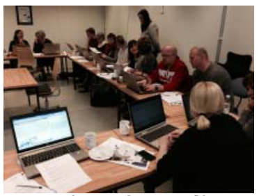
21 teachers from Aalborg Handelsskole in Northern Jutland participating in a TOOLS Lifelong Learning

All the project teams have been very busy running the TOOLS courses for the last twelve months of the project period. In Denmark SDE has been running courses for teachers in Southern Denmark (39 participants), in Nørre Sundby (21 primary and secondary school participants who also learned about Clil4U), and in Aalborg (16 participants)