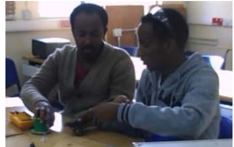
Two Asylum Seekers from Africa attending a CLIL based course at MCAST

MCAST has seen an influx of returning adult students, students from member EU countries and also asylum seekers / refugees coming to our many institutes. Their aim is to develop their knowledge and skills which will make them more competent and employable. Their unique perspectives to education allow us to understand how people learn and experience education across Europe, the Middle East and Africa. Using this knowledge we are able to better prepare our students to work together cooperatively in a diverse environment. We are opening our doors to make education diverse and breaking down cultural barriers in the process.