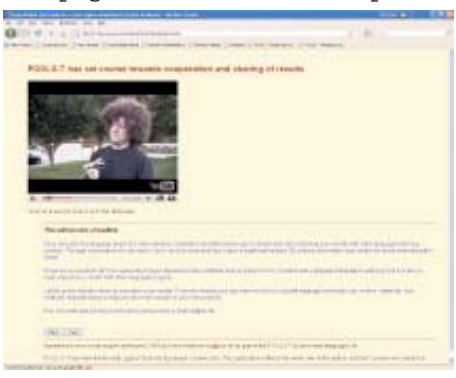
POOLS-T desk top tool supports YouTube videos

Main focus was of course the function of the two tools which the project will deliver. We experimented with Greek fonts and had a first success with exporting web pages from the desk top tool