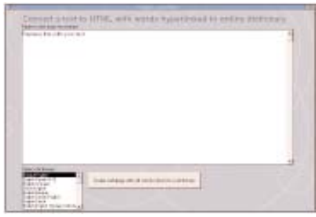
experimental simple version suitable for students working with technitexts

with presentation of Greek letters, at least when we used ISO fonts. The final version of the tool will have support for Unicode fonts as those are the future and will also enable other non Latin fonts, e.g. Cyrillic and Arabic.