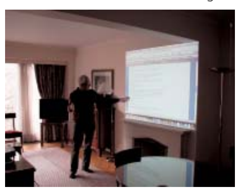
Kent Andersen demonstrating the blog facilities to the new project members

The SLM has now joined the POOLS-T project, in order to test the tools developed and to create its own CLIL materials (texts and videos), which will also be used for tool testing.