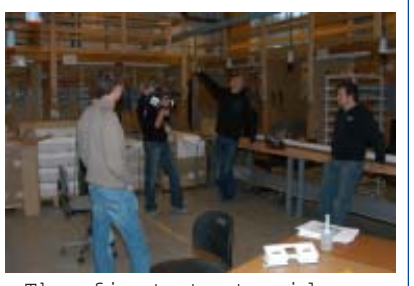
The first test videos for the materials pools are being produced at Odense Tekniske Skole, Denmark. The pools partners will produce copyleft video materials in nine languages.

5. A website, which will serve as portal to clustering projects and other ICT and LA projects. The site will contain all of the project materials, videos, discussion area and e-mail lists.